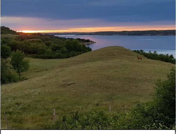
Over 200 acres of land to hike and explore