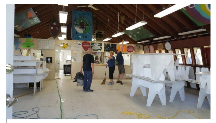
Dining Hall seats approximately 75 - Currently under construction