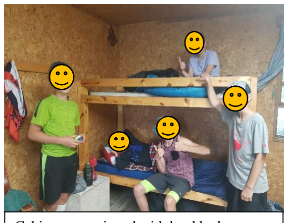
Cabins are equipped with bunkbeds