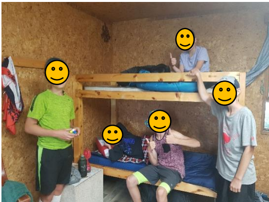
Cabins are equipped with bunkbeds