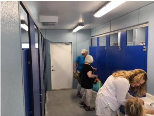
New, modern washroom and shower facilities