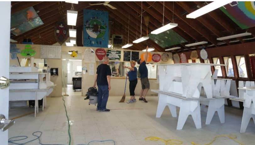
Dining Hall seats approximately 75 – Currently under construction