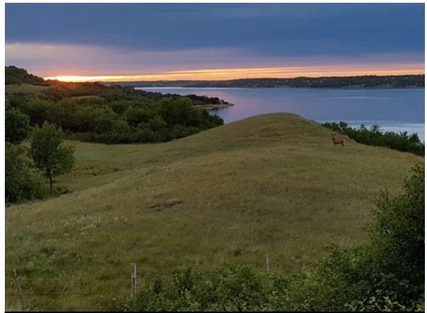
Over 200 acres of land to hike and explore