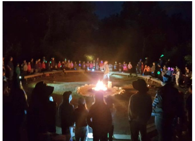
Large fire pit with benches